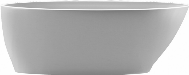
Features an integrated overflow.