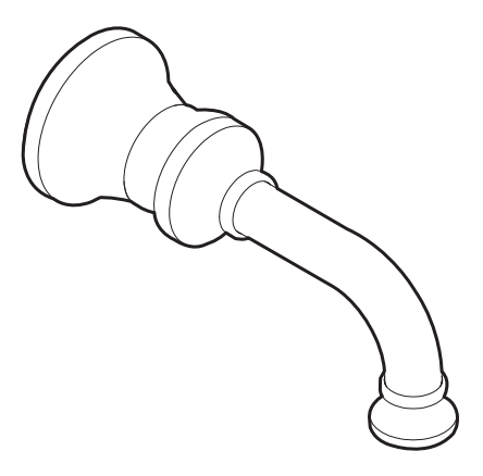
COLINET™ 1/2" Slip Fit Non-Diverting Tub Spout